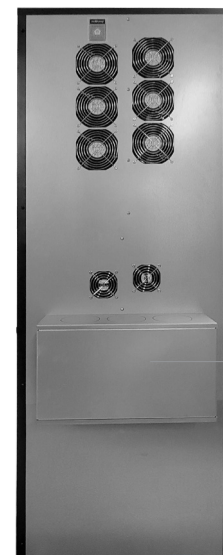
E91-40K rear view

Top or bottom cable entry from rear. Terminations in the front