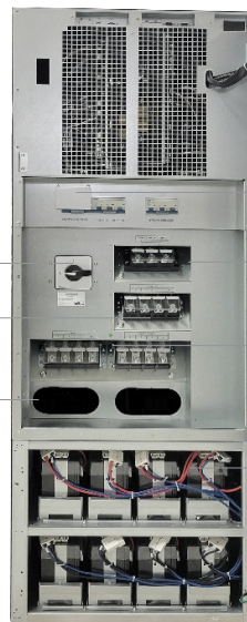
E91-40K front view (door & panels removed)

Input, Output & Maintenance Bypass Breakers